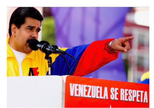
Venezuela demands respect.

Key in the US hybrid war to achieve regime change in Venezuela are the economic sanctions. The report forthrightly describes the "multiyear economic crisis, one of the worst economic crises in the world since World War II." The report notes: "Imports—which Venezuela relies on for most consumer goods—have fallen by almost 95% since 2013. The country