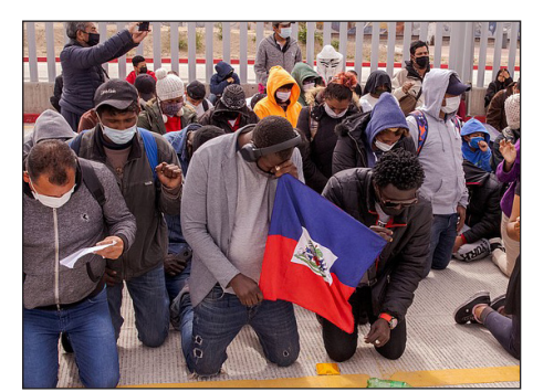
Haitians at US-Mexico border pray for Biden to grant them asylum.

"Nobody wanted to share the food being distributed with them [the Haitian camp residents]," he said, adding that he also received reports that an informal school run by residents also stopped Haitian children